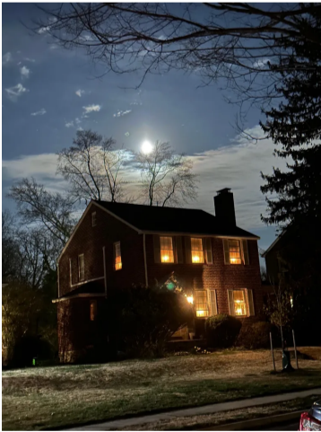
Krononaut Moon over Maryland in 2023

It's what we call community time travel research (or Krononautics ). Citizen scientists, conceptual artists, rocketeers, drum circlers, quantum physicists, universities, community and theater groups are encouraged to develop projects around the Krononaut Moon in 2024, 2025, and the years beyond. [4] The location is up to you and your collaborators. We'll calculate the time and you pick the place.