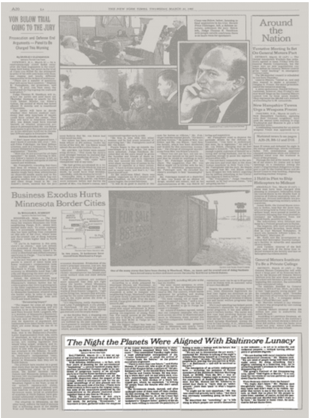
The Night the Planets Were Aligned With Baltimore Lunacy