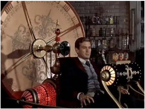
The Time Machine (1960)